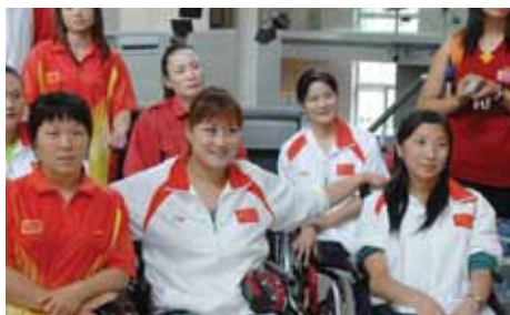
China's National Women's Basketball Team in action at IPD 2007