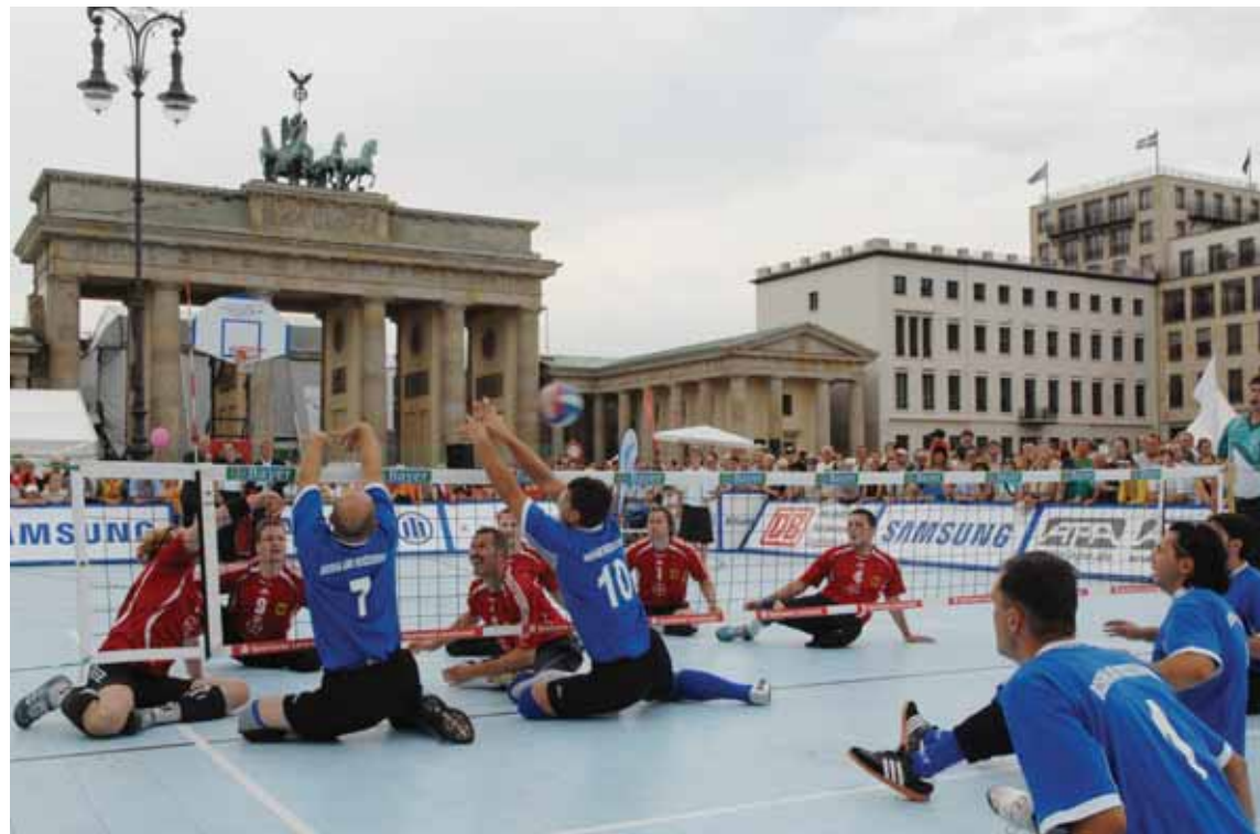
Action from the IPD 2007 in Berlin