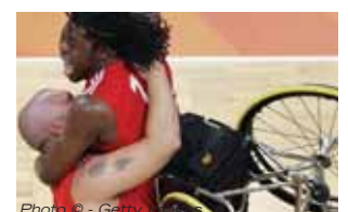
Interview with Ade Adepitan p.4