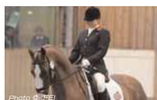
Para Dressage World Champs p.5