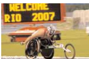
2007 Rio Parapan American Games p.8