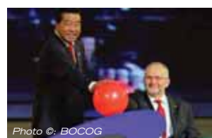
One-year out 2008 Beijing Paralympic Games p.2