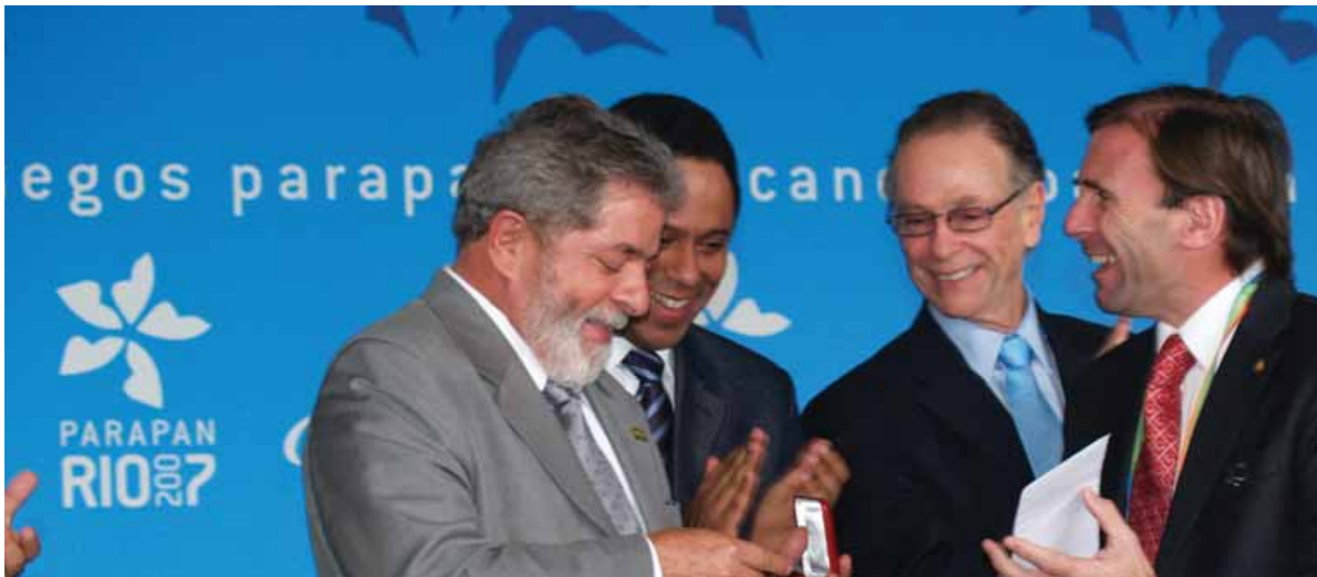
Brazilian President Lula receives Paralympic Honour